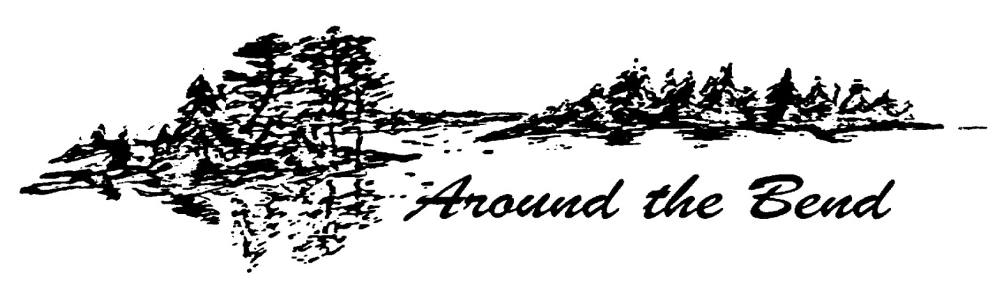
In The Year 2011