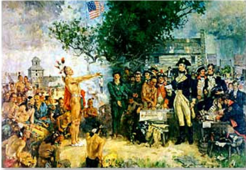
The Treaty of Greenville